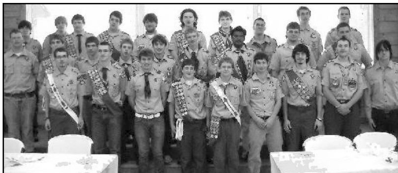
Eagle Scout Class of 2010 was honored at the Eagle Banquet on February 5th

Call 1-866-617-8464 for reservations and information on the great camping at Indiana Beach’s NASCAR RV Resort or Jellystone Campground and RV Resort.