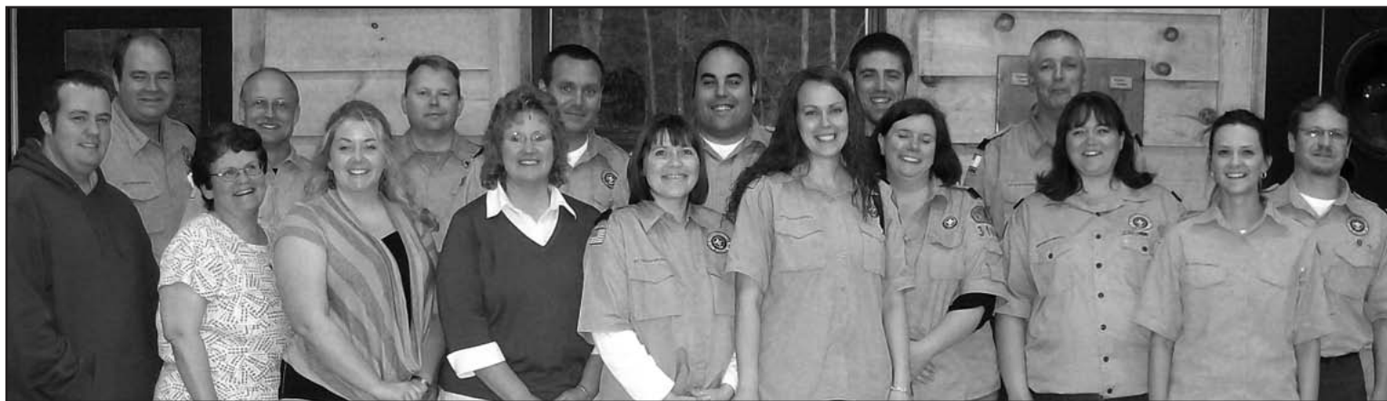
Outstanding Unit Leader Award Recipients 2011