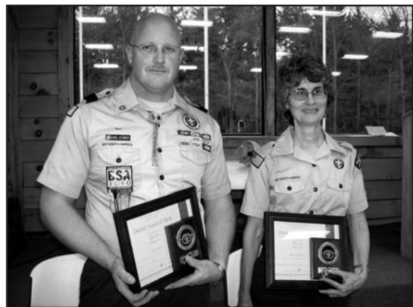
2011 District Award of Merit Recipients